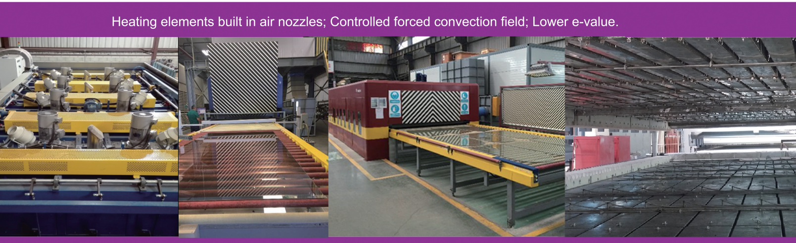
Heating efficiency improved by 15% ~ 30 %; High tempering quality; Stronger in market competition.

Upper Convection + Lower Convection (Full Convection)